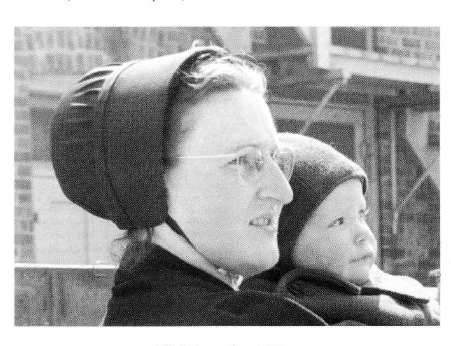
"Plain Bonnet" ca. 1950