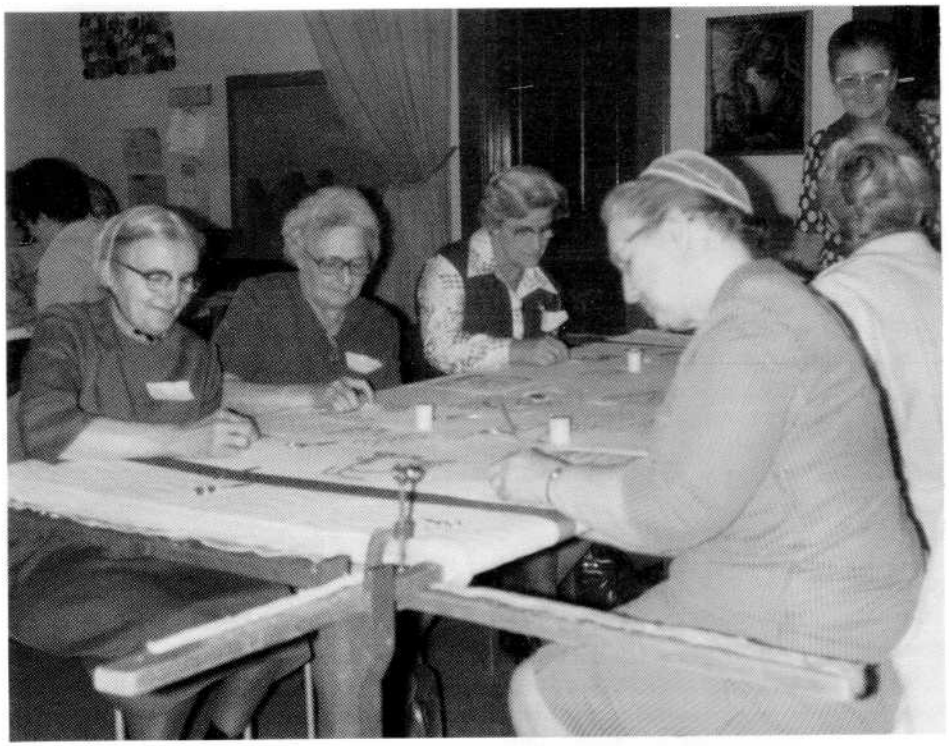
Socializing around a quilt, 1978

Surely the war also affected the lives of Mennonite women and surely they also struggled with what it meant, in a tangible sense, to be a nonresistant people. For those women whose husbands or sons were in alternative service, besides the emotional toll, there were sometimes