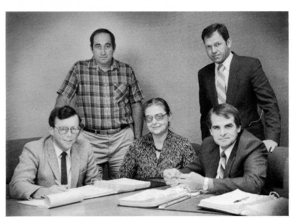
In the Mennonite Credit Union Boardroom, 1983

When attending her first meeting there was the usual election of officers. The "sister" on the committee was nominated as secretary. To the surprise and bewilderment of the committee she declined the nomination.