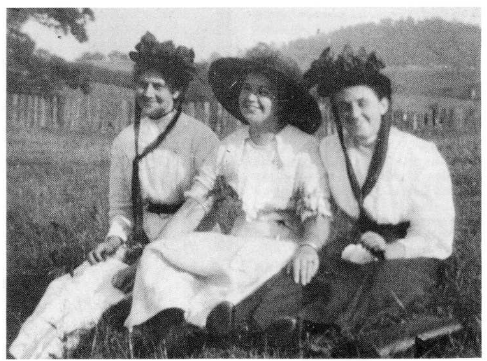
Two "Hat Bonnets", ca. 1910