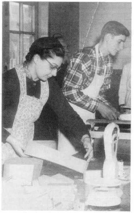
In the Marketplace, ca. 1958

Christian woman have her hair cut and styled according to worldly fashions? Many of my generation feel that they can. It ceased to be an issue.