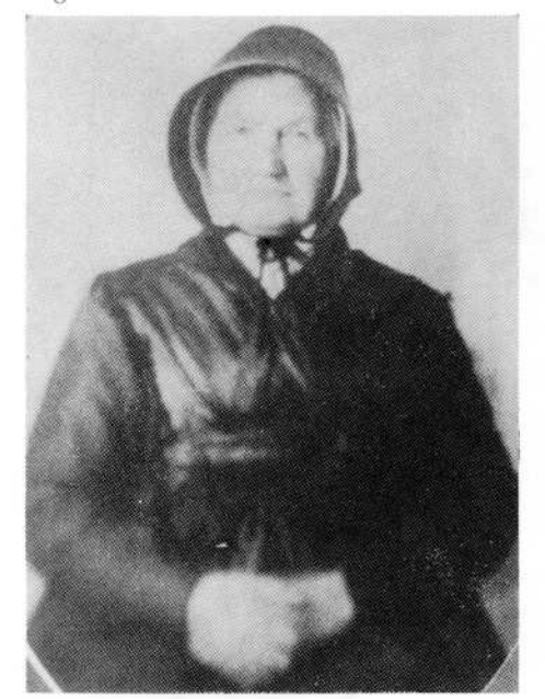
Bonnet ca. 1865