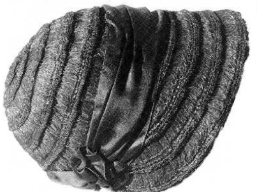
Bonnet ca. 1918 (taken 1990) (CGC Archives photo)

(CGC Archives photo) Bonnet worn ca. 1935