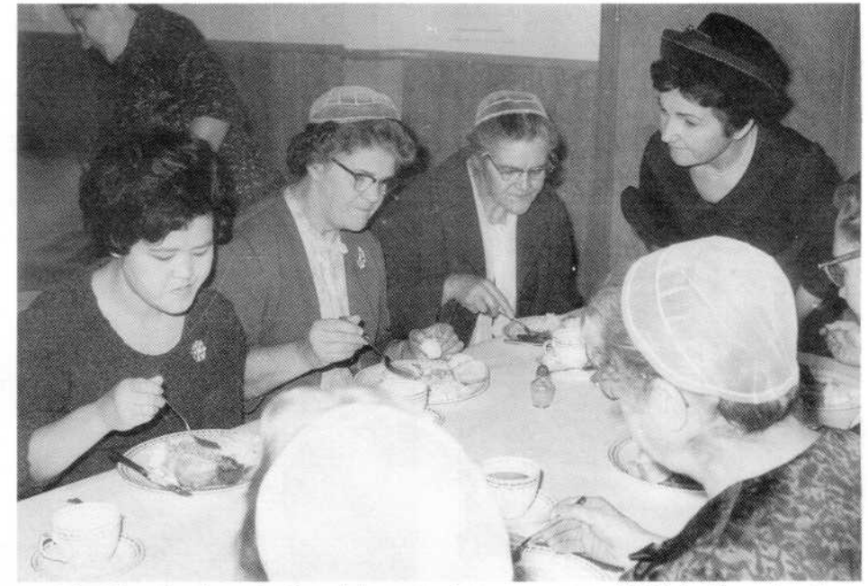
The "devotional covering", a white net head dress, ca. 1965.

Changes for women in the Ontario Swiss Mennonite community have been considerable since the turn of the century when for the first time it was recorded that "three sisters" attended a business meeting of a local congregation thus indicating their desire to participate more fully in the life of their congregation. However, women members on a committee frequently found themselves relegated to the position of secretary as their committee's "girl Friday." 5