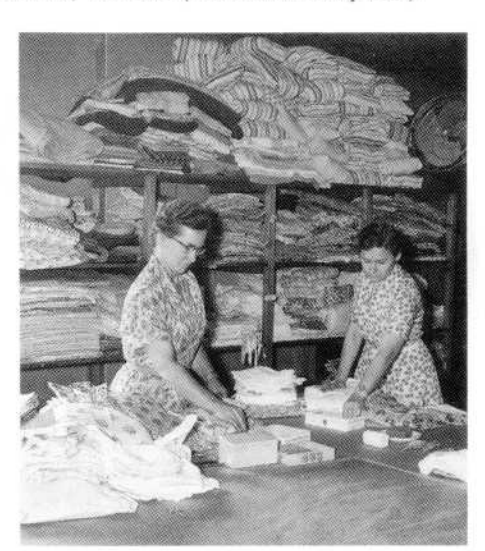
The MCC clothing depot, ca. 1955